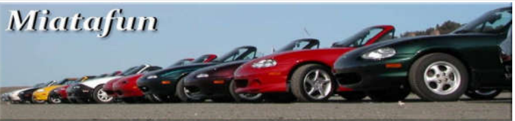
A place to find something to do with your Miata and Friends. Seek new adventures and places to Drive and Share.

Stay in touch electronically with your Socalm friends through the club's Yahoo Group. Go to http://autos.groups.yahoo.com/group/socalm/ and click the "Join This Group!" button. The group averages less than five emails a day so it won't be a burden on your inbox.