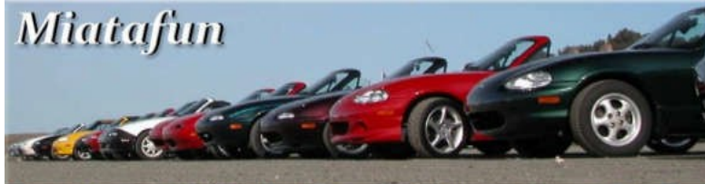
A place to find something to do with your Miata and Friends. Seek new adventures and places to Drive and Share.

Serving our Miata friends since 2/22/2002 http://miatafun.net/